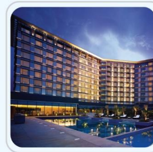
5 STAR HOTEL SERVICES